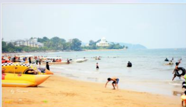
PORT DICKSON BEACH

Port Dickson is a popular beach destination in the state of Negeri Sembilan, Peninsular Malaysia. About 60 kilometers from Kuala Lumpur, Port Dickson, or PD to locals, is about an hour's drive from Kuala Lumpur along the North-South Highway and about 32 km from Seremban.